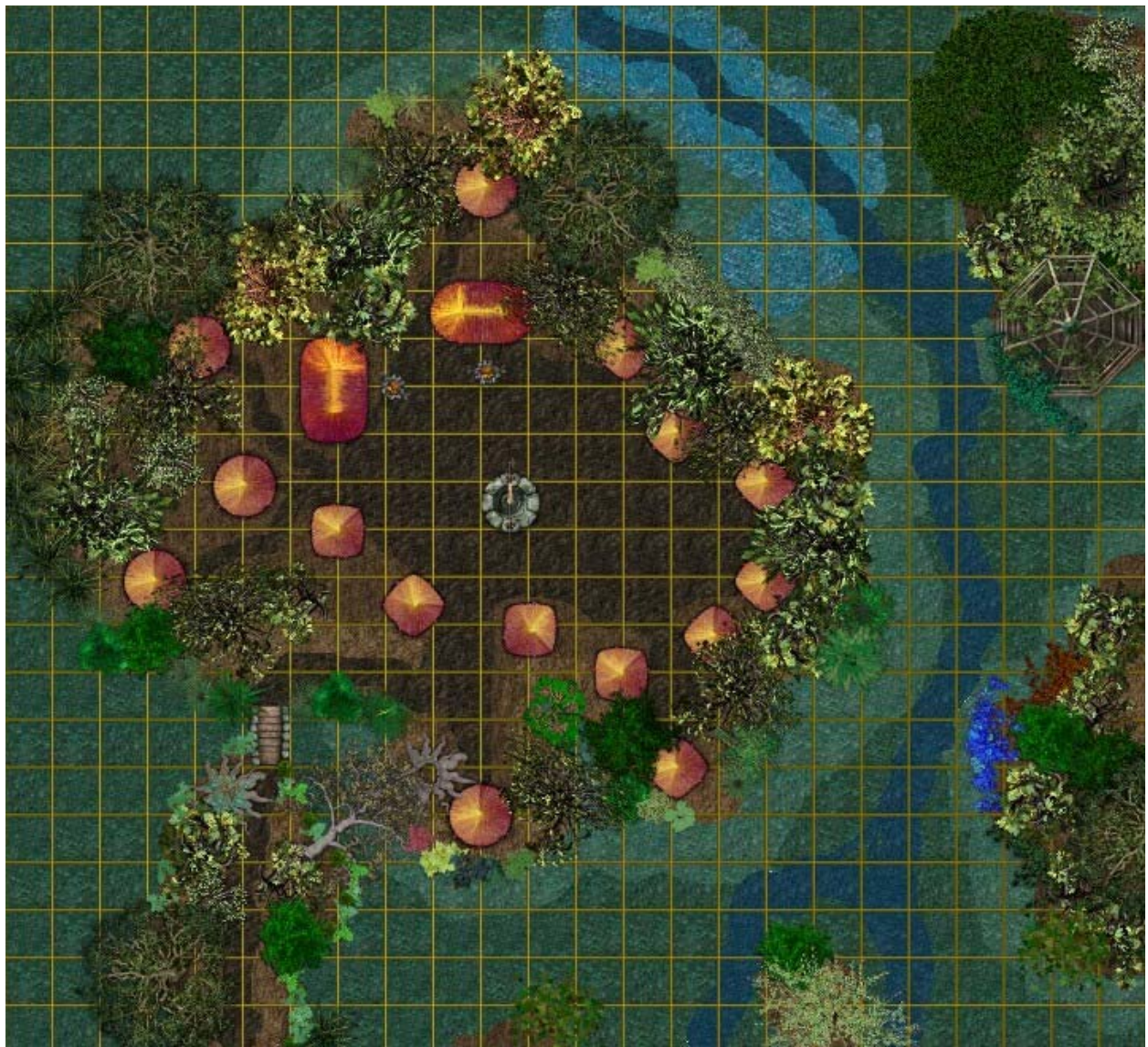
Map 2: The Lizardfolk village The scale is 1 square= 10ft