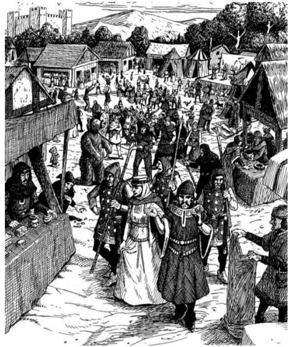
Image 1: Lord Agnard escorting Lady Cezia through the Market in Stone Battle